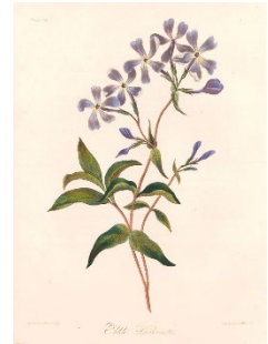
Wild Blue Phlox

Keep a look out for these beautiful flowers in the spring before they disappear again until the following year.