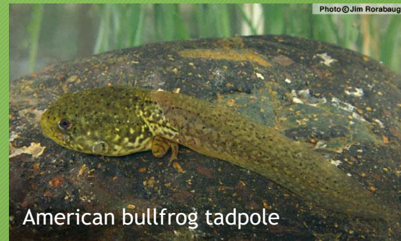
American bullfrog tadpole

Clue #5: I am born without legs, but I develop four legs as an adult.