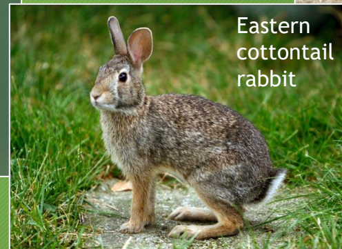
Eastern cottontail rabbit