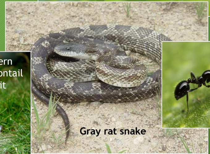
Gray rat snake