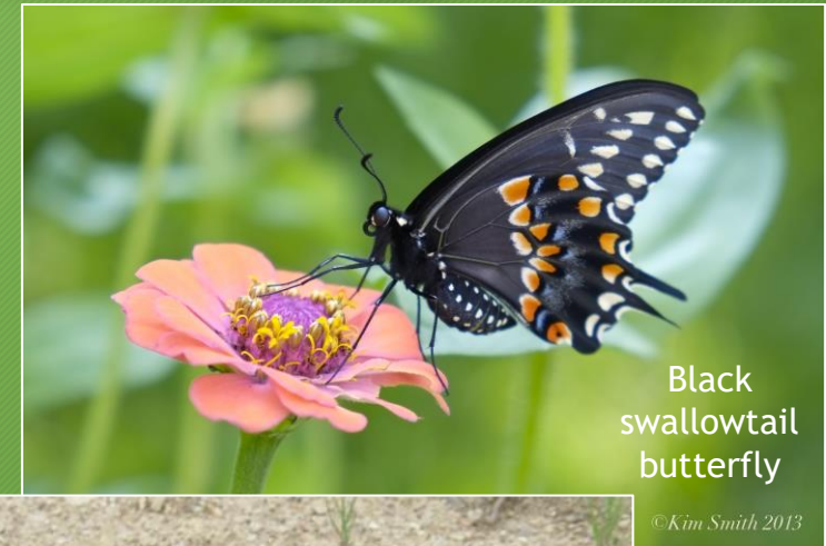
Black swallowtail butterfly