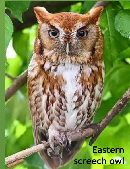
Eastern screech owl